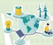
RE Project Finance Agencies