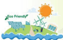
RE Project Analysists