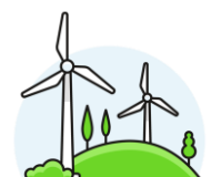
Wind Project Developers