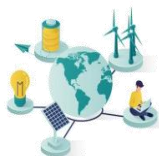
RE Project Analysist