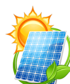
Solar Project Developers